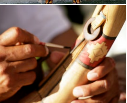
Arizona Indian Festival